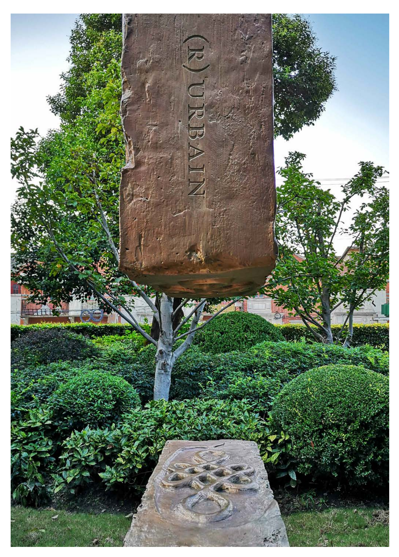
Zoé Vayssières "Doors to memory", 2018 (bronzed sculpture, 325cm x 325cm x 69cm) Close up on (r)urbain.