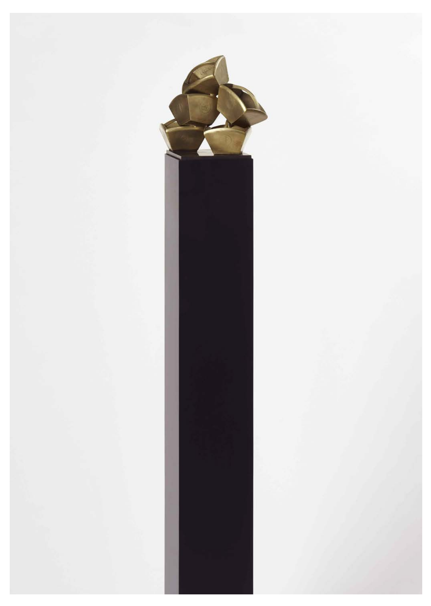
Zoé Vayssières "Beyond Measure", 2016 (bronzed sculpture, Unique piece, 15 x 138 x 15cm with base)