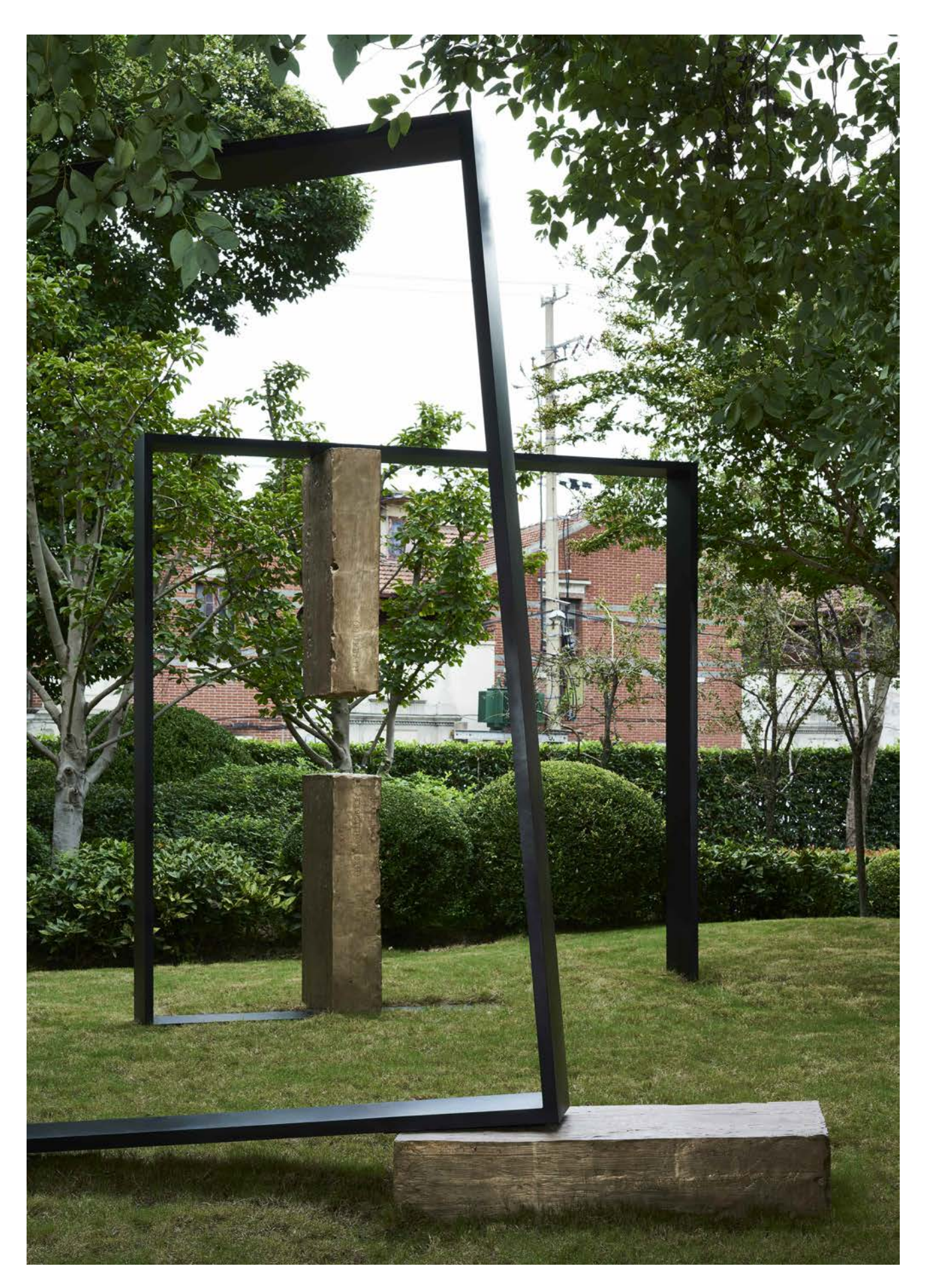
Zoé Vayssières "Doors to memory", 2018 (bronzed sculpture, 325cm x 325cm x 69cm) Installation at Jing'an Sculpture Park, 500 beijing road, Shanghai, China.