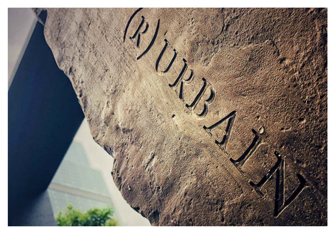
Zoé Vayssières "Doors to memory", details, 2018 (bronzed sculpture, 325cm x 325cm x 69cm)