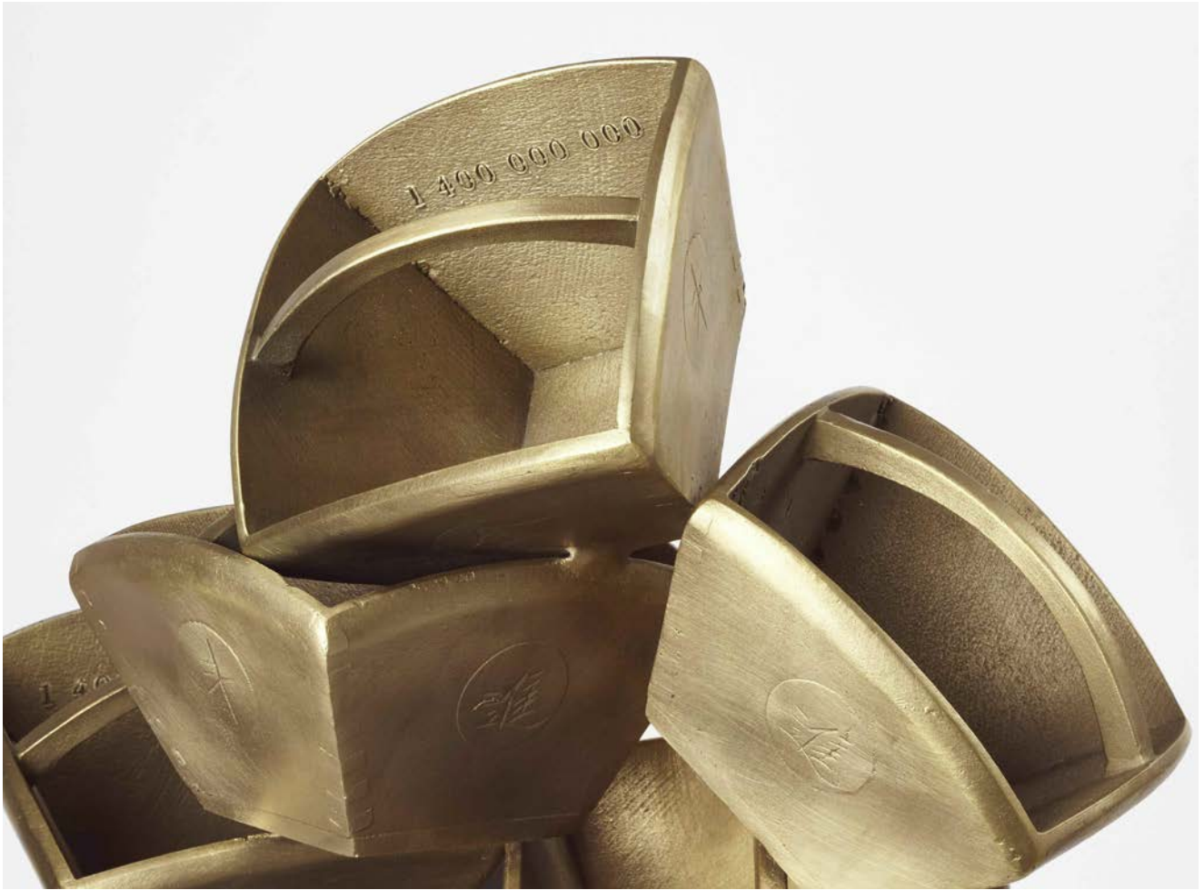
Zoé Vayssières "Beyond Measure", detail, 2016 (bronzed sculpture, Unique piece, 15 x 138 x 15cm with base)