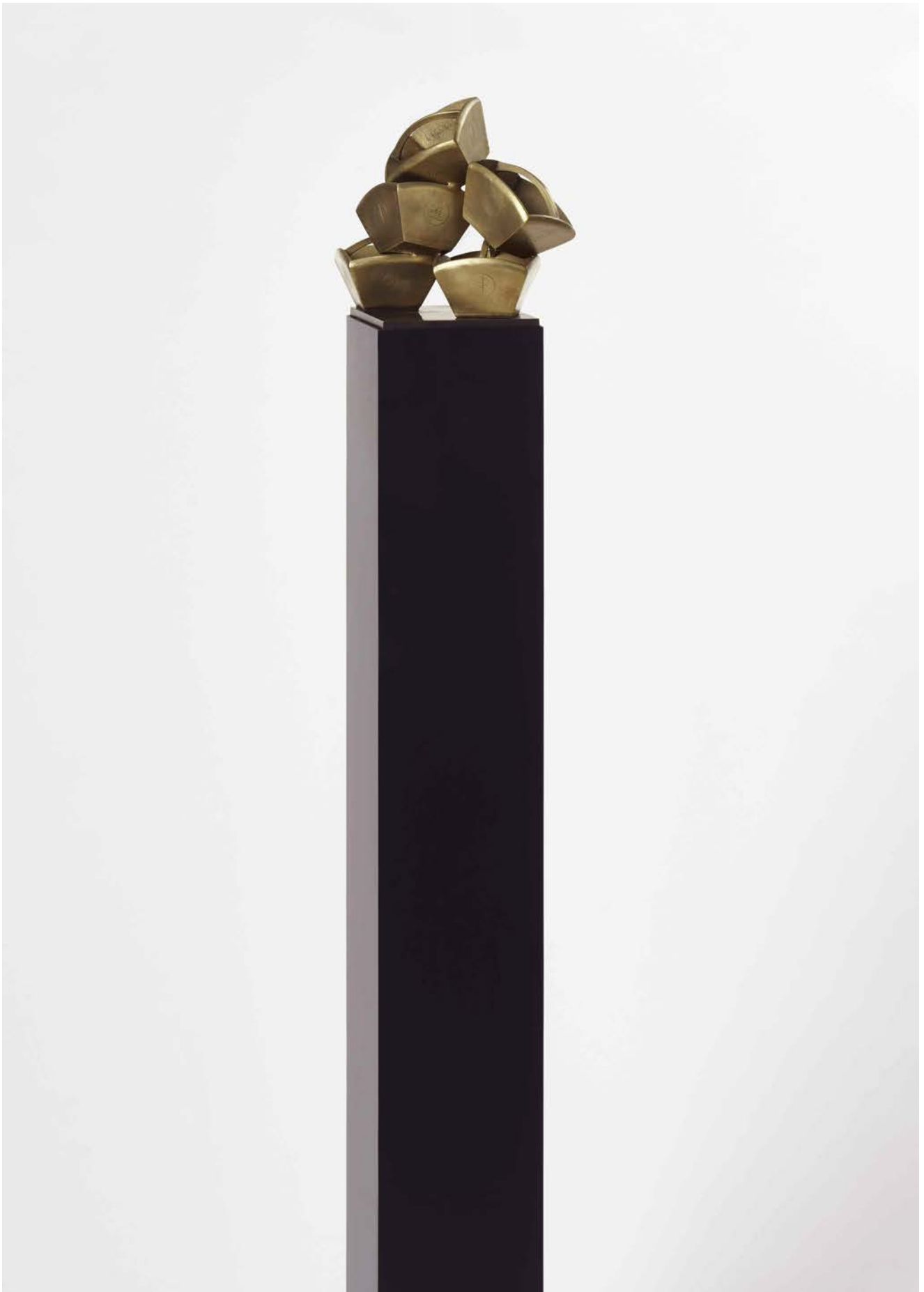
Zoé Vayssières "Beyond Measure", 2016 (bronzed sculpture, Unique piece, 15 x 138 x 15cm with base)