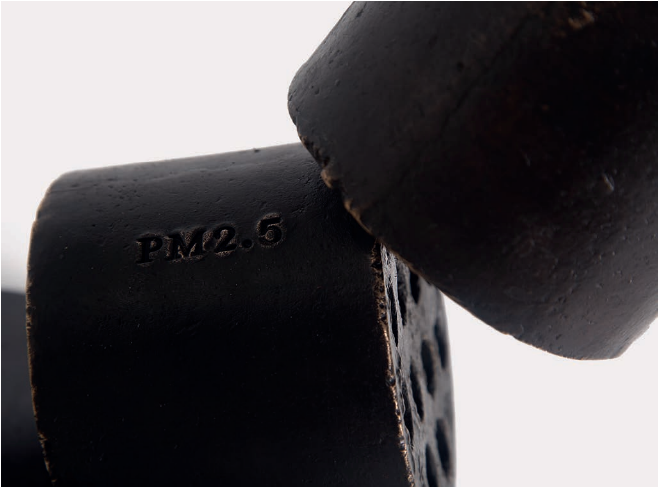
Zoé Vayssières "Heaped Coal", detail, 2016 (bronzed sculpture, edition of 8, Ø16 x 71cm)