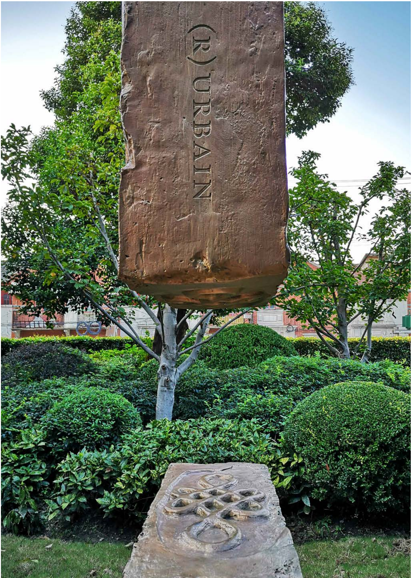
Zoé Vayssières "Doors to memory", 2018 (bronzed sculpture, 325cm x 325cm x 69cm) Close up on (r)urbain.