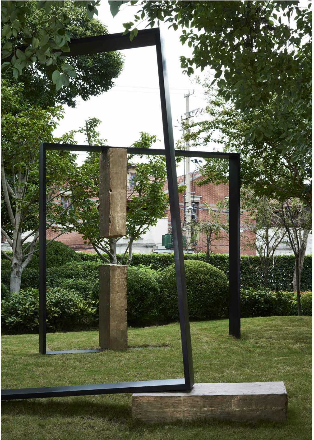
Zoé Vayssières "Doors to memory", 2018 (bronzed sculpture, 325cm x 325cm x 69cm) Installation at Jing'an Sculpture Park, 500 Beijing Road, Shanghai, China.