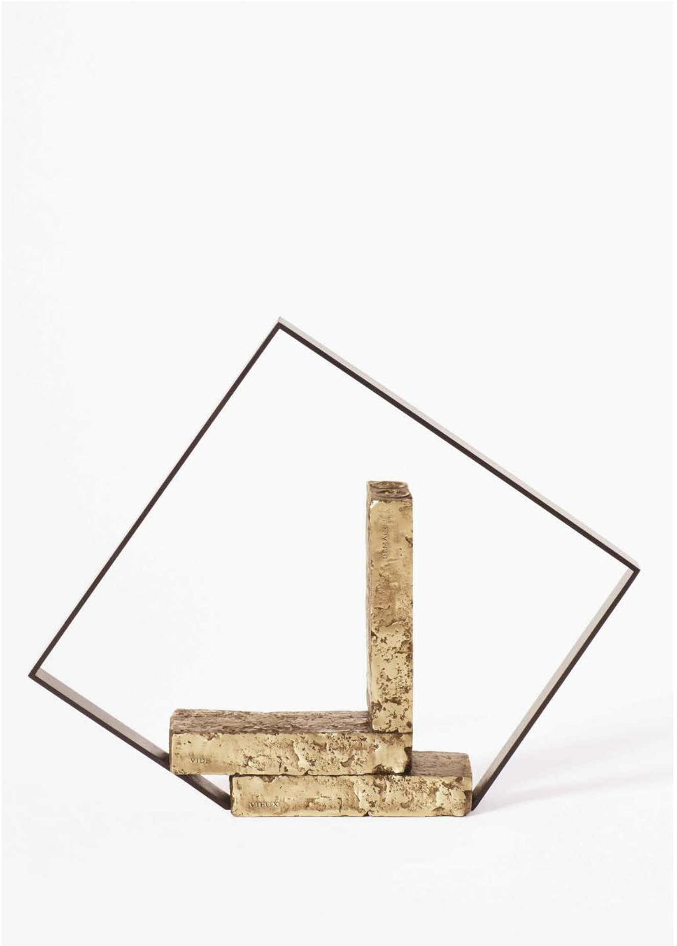
Zoé Vayssières "Constructivist Bricks", 2017 (bronzed sculpture, edition of 8, 54 x 43 x 10cm)