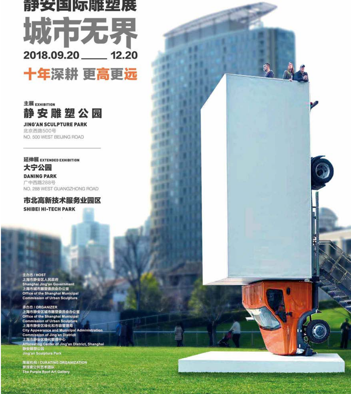
Exhibition poster. Jing'an Sculpture Park - 500 West Beijing Road - Shanghai - China