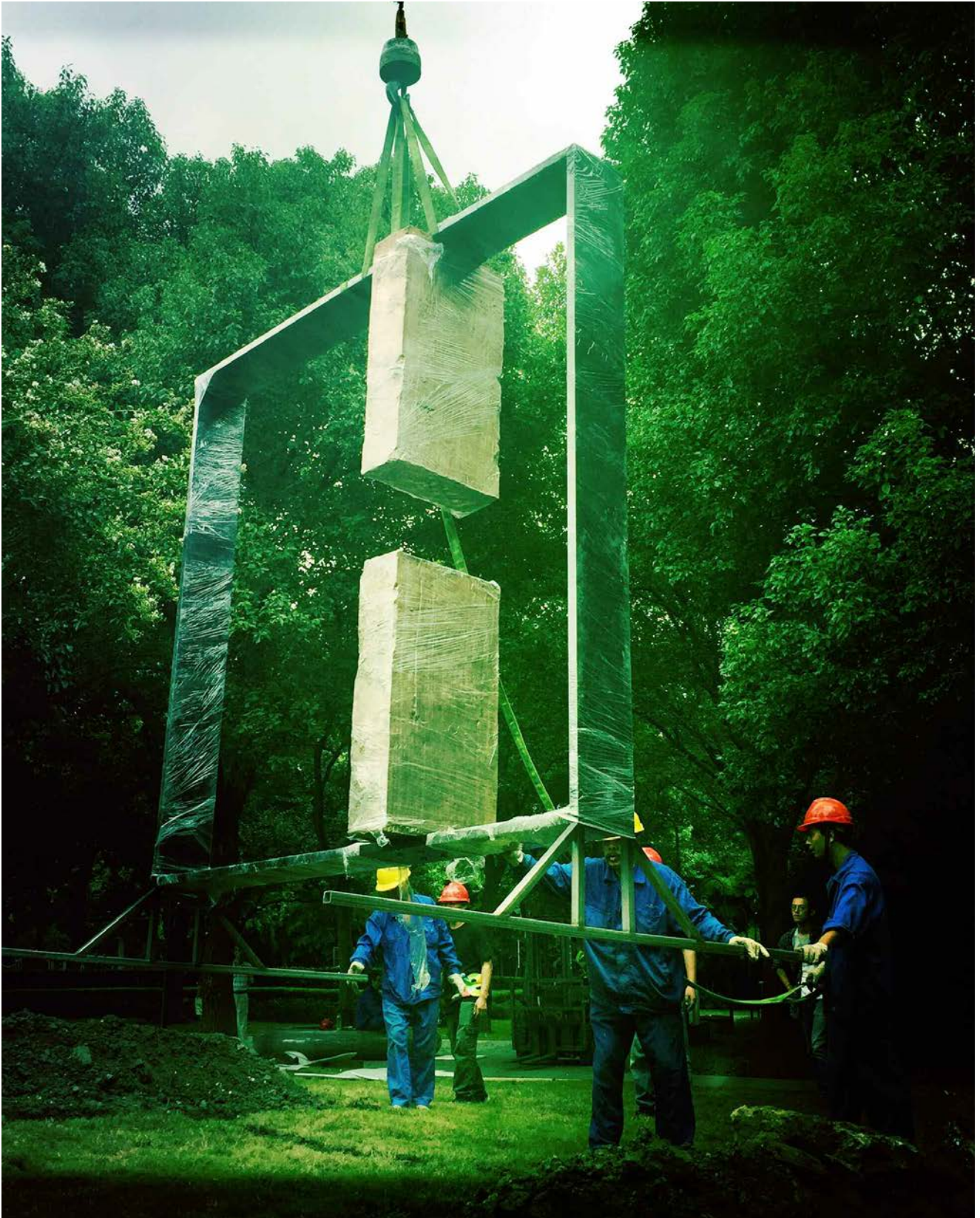
Installation of the sculpture in the park.