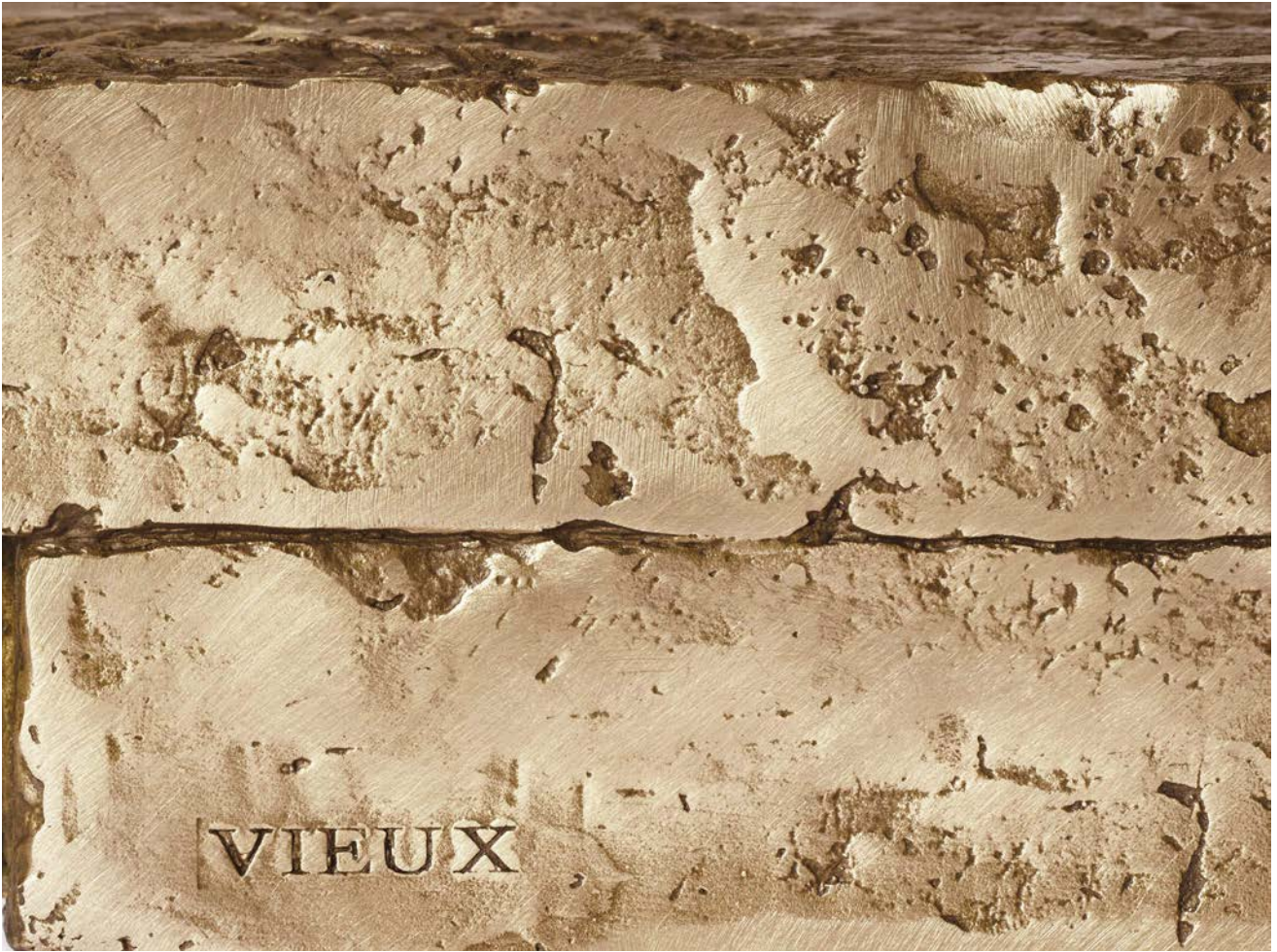
Zoé Vayssières "Constructivist Bricks", detail, 2018 (bronzed sculpture, edition of 8, 54 x 43 x 10cm)