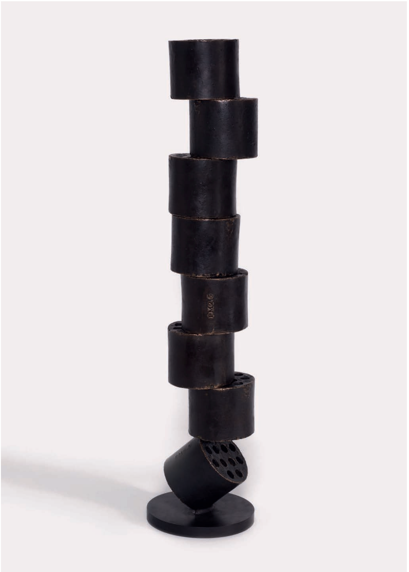
Zoé Vayssières "Heaped Coal", 2016 (bronzed sculpture, edition of 8, Ø16 x 71cm)